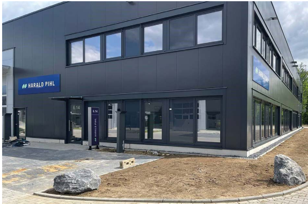
The new premises of HARALD PIHL GmbH, one of the first companies in Germany to be 90% CO 2 -free.

By Joanne McIntyre, Stainless Steel World