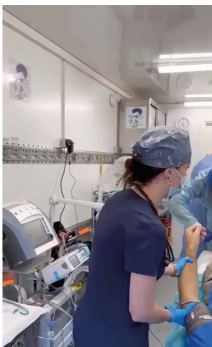
Patient surgeries are conducted daily in the mobile medical care unit in eastern Ukraine.

The social activities at HARALD PIHL extend beyond a fun workplace. The company is conscious of its social responsibilities and actively supports