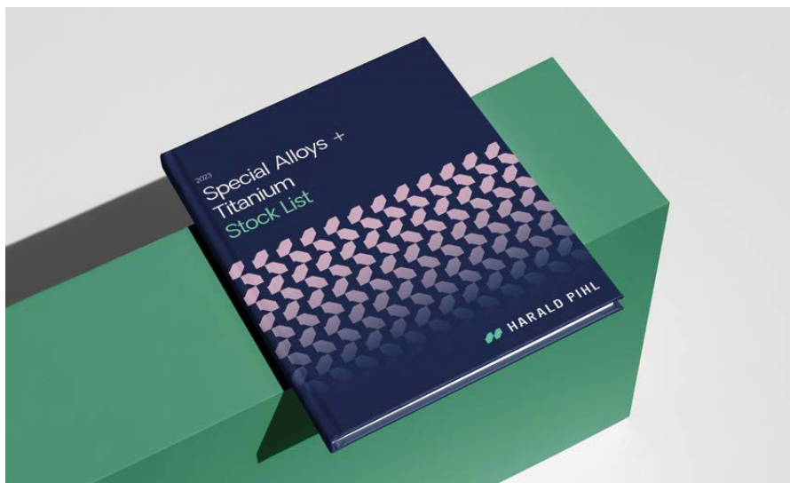
The comprehensive HARALD PIHL stock list with the new graphic design.

a variety of charitable causes. For example, the day after Russia invaded Ukraine in February 2022, proceeds from every order placed at HARALD PIHL were donated to UNHCR - the UN Refugee Agency - to help affected people. The money is used to send help packages containing emergency supplies such as blankets, sleeping bags, hygiene items, water and winter clothing to those in need.