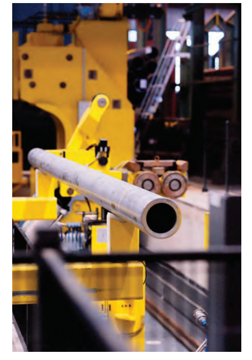
Efficiency in manufacturing is vital for new technologies in decarbonisation requiring stainless steel and nickel alloy tubes and pipes.