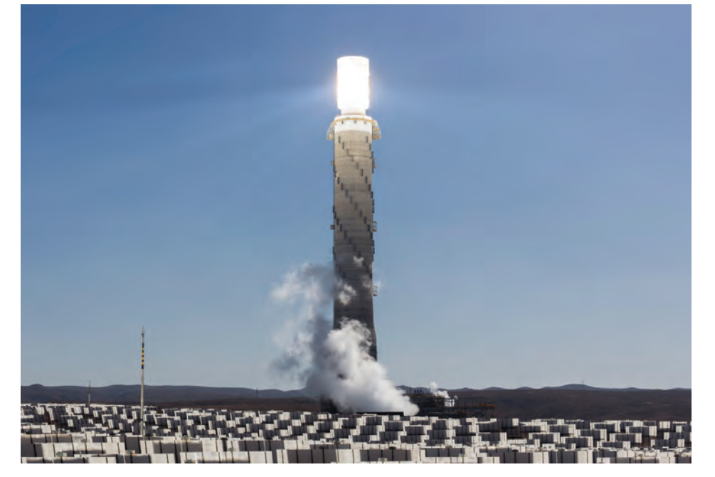
The MST team is utilising the vast expertise of the SZMF R&D institute for projects ranging from solar power to fertilizers.

The MST team has observed that decarbonisation is driving many technical challenges in its premium product market segment. "This evolution presents many challenges to the industry in general,