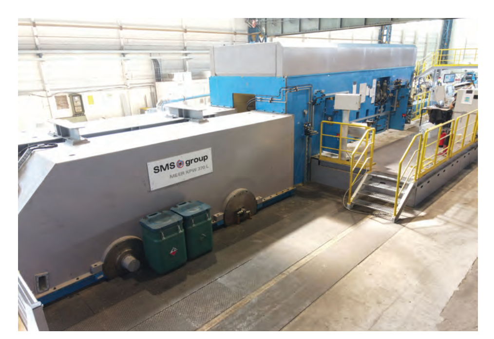
The newly commissioned KP2 at MST's Remscheid plant is the world's largest cold pilgering machine.