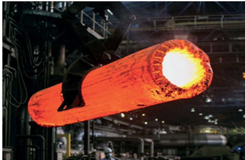
The company's mother mills in Japan are committed to providing a stable supply of steel products, both in Japan and overseas.