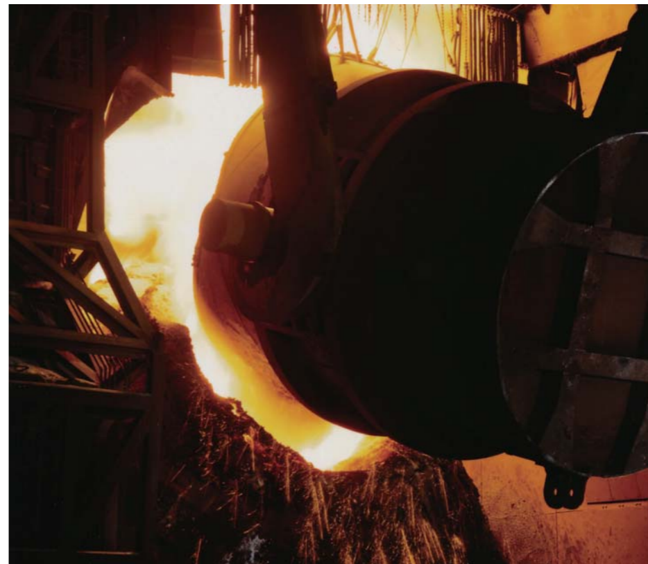
Nippon Steel is accelerating its development of high tensile products and highly corrosion resistant seamless pipes and tubes.

Nippon Steel Corporation presented in Stainless Steel World Japan held on 16 th to 17 th February regarding UNS S34752 with superior sensitization resistance and creep rupture strength to UNS S34709. The characteristics of S34752 are superior sensitization resistance by both extra low Carbon control and higher Nb/C ratio and maximum 30% higher creep rupture strength by both Cu and B additions compared with S34709. In addition, UNS S34752 indicates higher SRC (Stress Relaxation Cracking) resistance than S34709 without PWHT (Post Weld Heat Treatment). S4752 has already registered to ASME Sec. VIII as Code Case 2984. We believe that S34752 is applied for heater tubes or heat exchanger tubes in a complex refinery and petrochemical equipment as the replacement of S34709 because of saving fabrication cost by both thinner wall thickness of material and the elimination of PWHT, and decreasing SRC risk during actual operation.