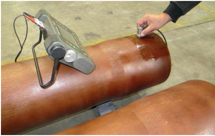
Manual UT examination of a weld overlay upset end.