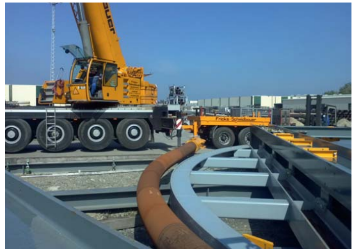
GluBi® pipe: Simulation of a reeling process; no evidence of liner wrinkling.