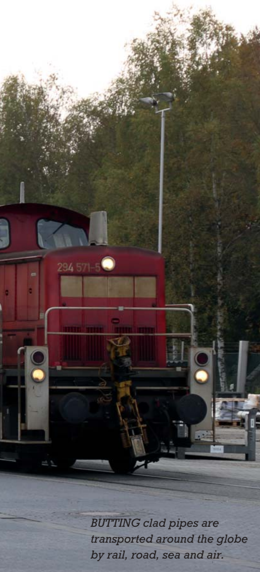
BUTTING clad pipes are transported around the globe by rail, road, sea and air.