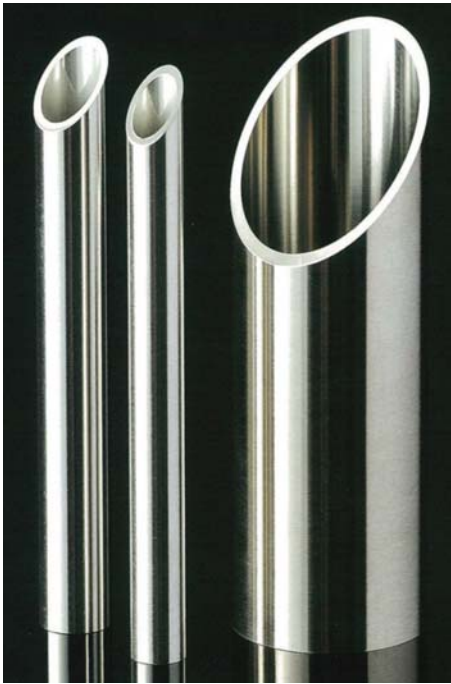
Clean pipe for semiconductors (BA tube).

such as duplex, high-nickel, etc. because due to our original production control system, we have a stable supply of round bar billets from Kobe Steel, Ltd. and other leading manufacturers, as well as an abundant stock of round bar billets.” “Our particular strength is in cold processing goods with good quality and cold-drawing finish, and we can arrange a short time production time. In fact, our cold processing is based on our original technology, with which we can supply high quality small diameter bright annealed tubes. We have a 2000 ton press which can extrude a range of small diameter tubes.”