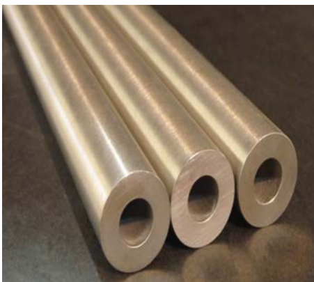
High pressure piping for a hydrogen station.

He continues: “The high degree of in-house expertise, built up over years of producing tubes for demanding semiconductor applications, mean that our products are all made to a very high quality. This also means we are able to produce tubes very quickly, for instance for prototype projects.”