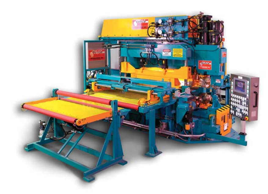
The QM Series Seam Welders produce high quality welds that are generally no more than 10% thicker than the parent material.

Recent machines have been used for strip up to 1,900mm (76") wide. Any weldable material can be joined on these machines. The welder is designed for use on either start/stop or continuous lines such as galvanizing, tension leveling, tin plate,, annealing, etc.