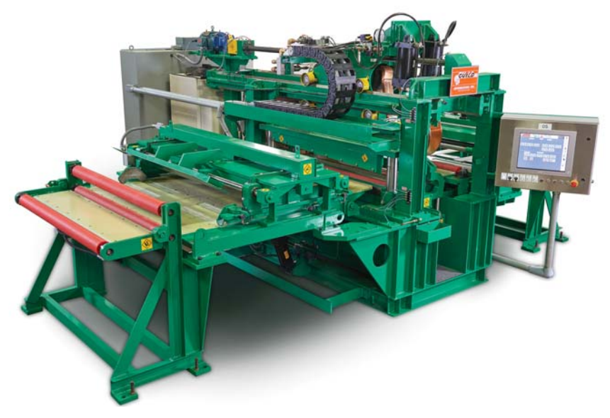
The NB Overlap welder is most commonly found on lines such as paint, tension leveling, etc.

The QM Series Seam Welders produce very high quality welds that are generally no more than 10 percent thicker than the parent material. Welds can be made in less than 25 seconds using these welders, depending on strip size. This system includes two machines, depending on client requirements. The QMT is used for higher speed applications and the QMM is used on heavier gauge applications. It joins together two coil ends by resistance welding two slightly overlapped strip ends and the welds created are often almost as strong as the parent material. The QMT and QMM can shear, weld, and planish material ranging from about 0.1mm (0.004") up to about 3.0mm (0.125") thick, and as wide as necessary.