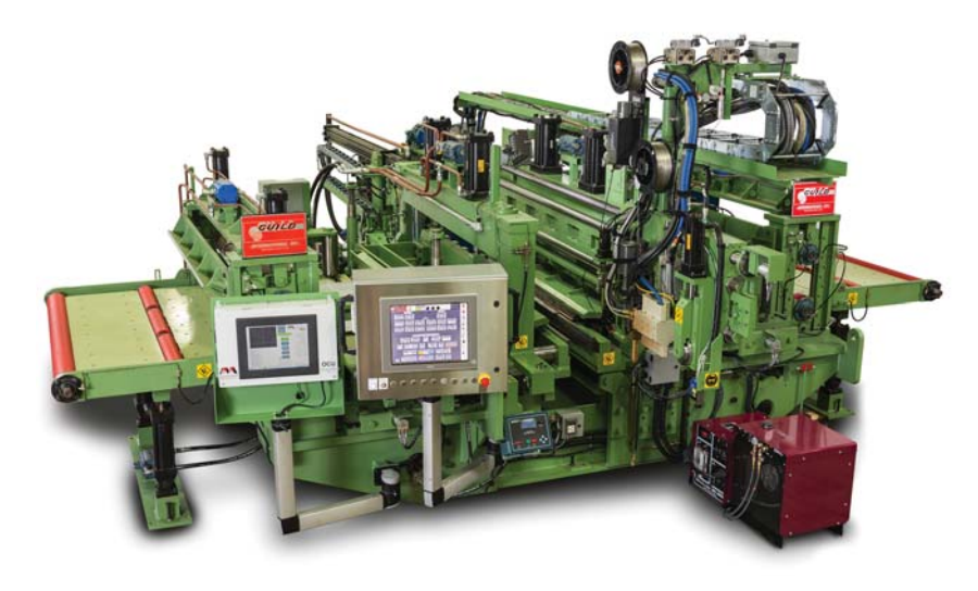
The RCM series of zipwelders produce a high quality weld.