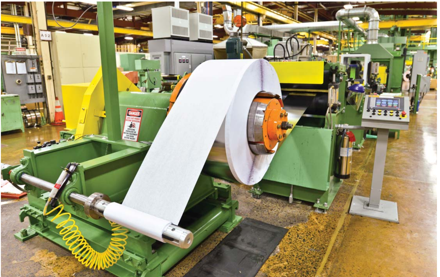
Heyco Metals is an industry-leading manufacturer of high-quality, light-gauge stainless steel in coil, sheet and strip.