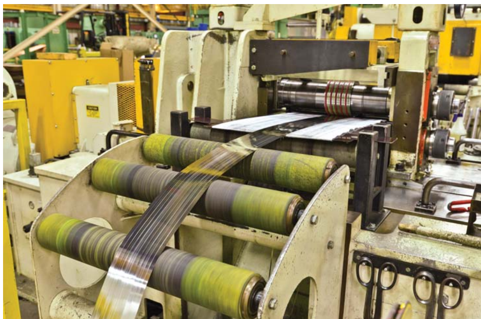
With high-temp strand annealing and stretch bend leveling capabilities, Heyco turns out a wide assortment of grades and gauges, all to exacting specifications.

Part of Heyco's strategy to expand more into the stainless steel market included branching out into the area of higher temperature nickel alloys, which require a special high temperature furnace. So in 2014, the company installed a furnace capable of annealing up to 2,150 degrees Fahrenheit (1,176 degrees Celsius). This proved to be an extremely important investment as it allowed clients the opportunity to choose from a variety of nickel alloys such as the 304- and 305-grades and