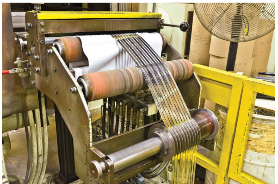
Heyco Metals excels at delivering custom orders, large or small, with quick turnaround times.