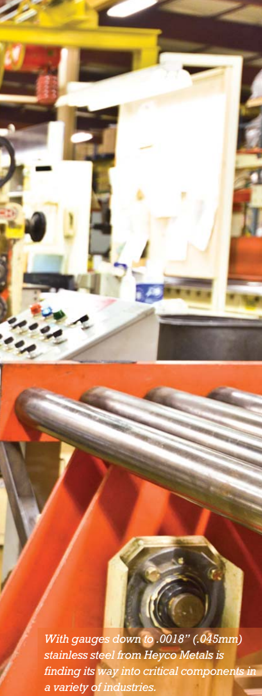
With gauges down to .0018" (.045mm) stainless steel from Heyco Metals is finding its way into critical components in a variety of industries.

even Inconel alloys (a family of austenite nickel-chromium-based superalloys).