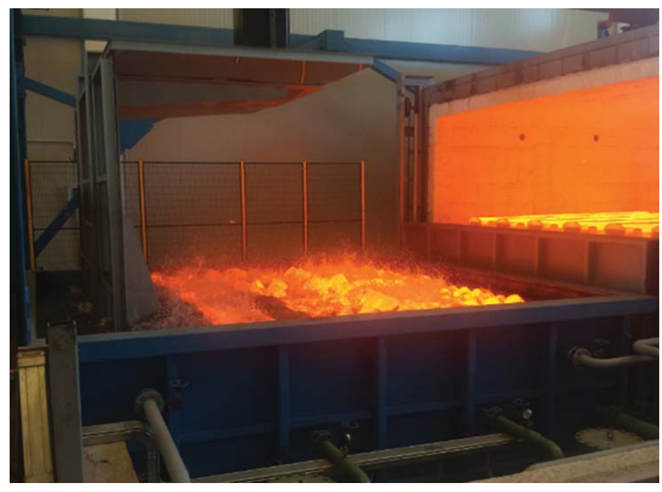
The new NORSOK-approved furnace: one of many recent investments at the Tecninox production facility.

What makes Raccortubi Group stand out is its capacity to effectively combine stockholding and manufacturing activities to provide its customers with the sought-after solution. The huge Raccortubi stock of pipes. tubes, fittings and flanges works two-fold: it offers the client ex-stock materials which already adhere to the most stringent market requirements, whilst supplying the Tecninox and Petrol Raccord plants with readilyavailable raw material pipes. With the exstock availability and the fast production of cost-efficient, high-quality butt weld fittings to specific customer requirements, Raccortubi can react quickly to clients' requests for complete project packages. Since the production is completely integrated within the Group, customers may have a single point of contact in Raccortubi for both the ex-stock and manufacturing requirements.