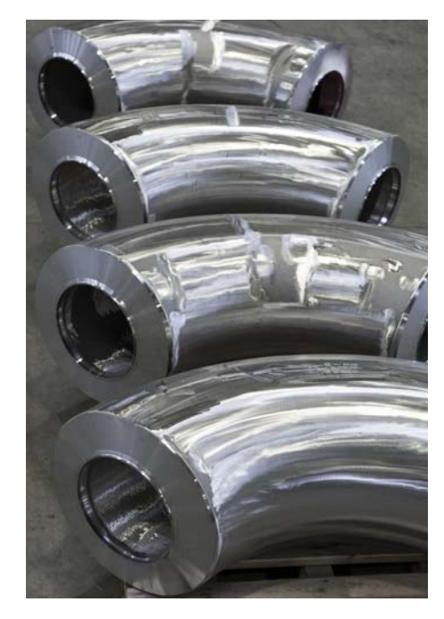
An example of the increased production range available at Raccortubi Group thanks to the acquisition of Petrol Raccord.