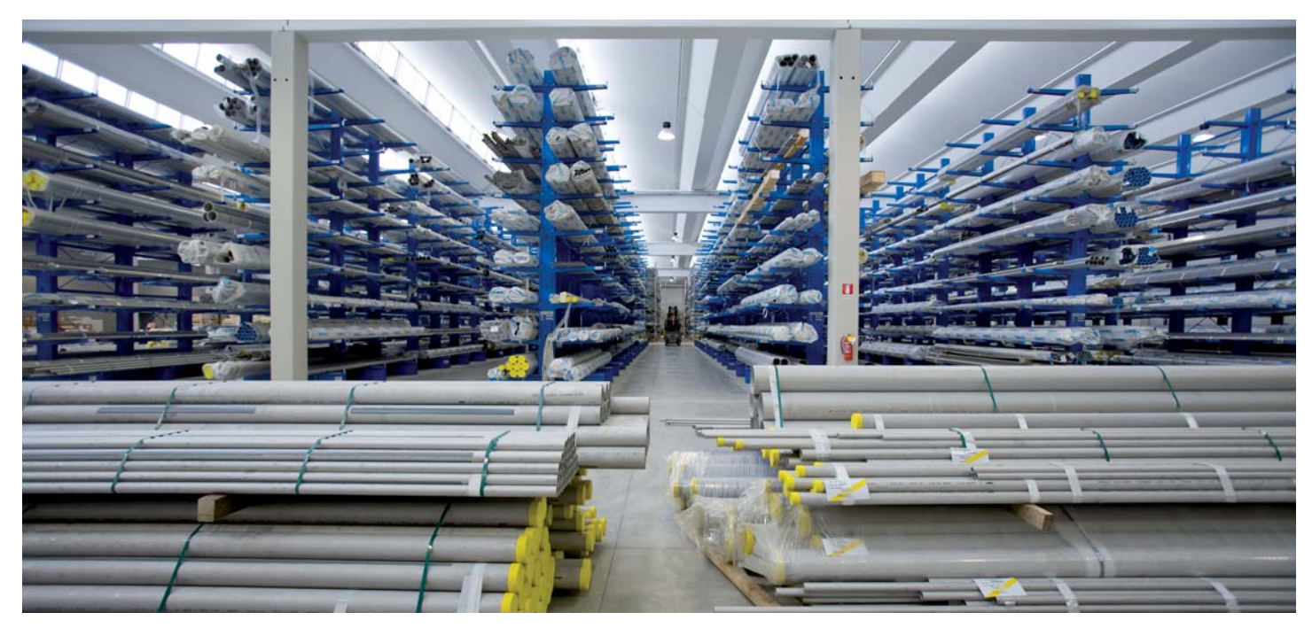
The huge stock of pipes and tubes at Raccortubi headquarters: for direct distribution, for project packages, and for base material for the integrated production plants.

in particular project packages. For example, imagine we receive an order for 300 items of fittings: 150 items are in stock, 100 will come from running production, and 50 must be inserted into planning. For many, making just 50 items would result in a lengthy and unreliable delivery time because the raw materials would first have to be sourced. However, at Raccortubi we already have the raw material in stock and our planning is flexible enough to quickly accommodate a fresh order into existing production. This dramatically reduces the lead time for delivering the full package requested."