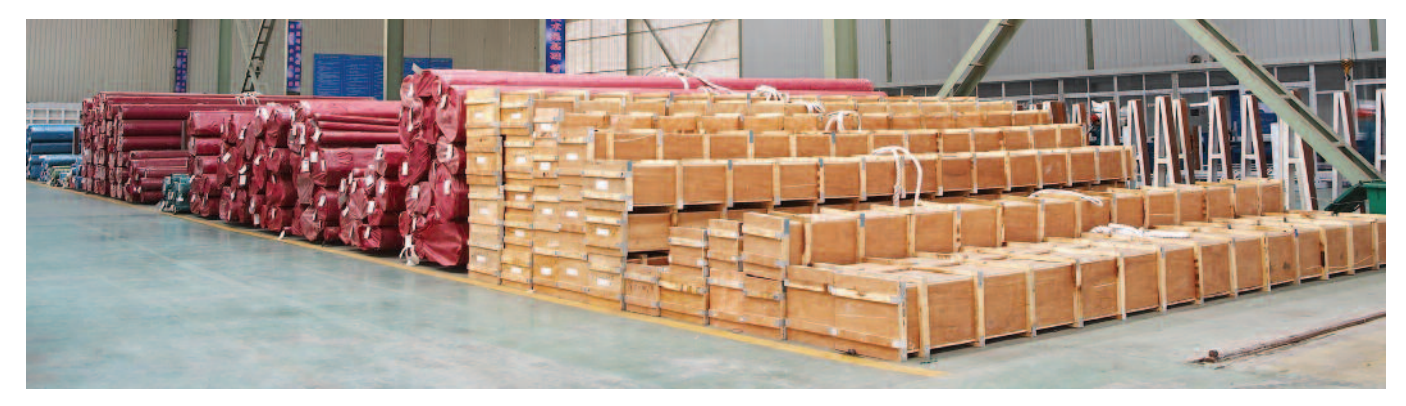
Stellar's finished products nowadays are sent to all four corners of the World.

Until recently 40% of Stellar's total exports went to Europe. However, this percentage has been considerably reduced due to the impact of European anti-dumping legislation. The European stockists that they used to deal with increasingly only purchase specialized products such as those with extra thicknesses and widths.