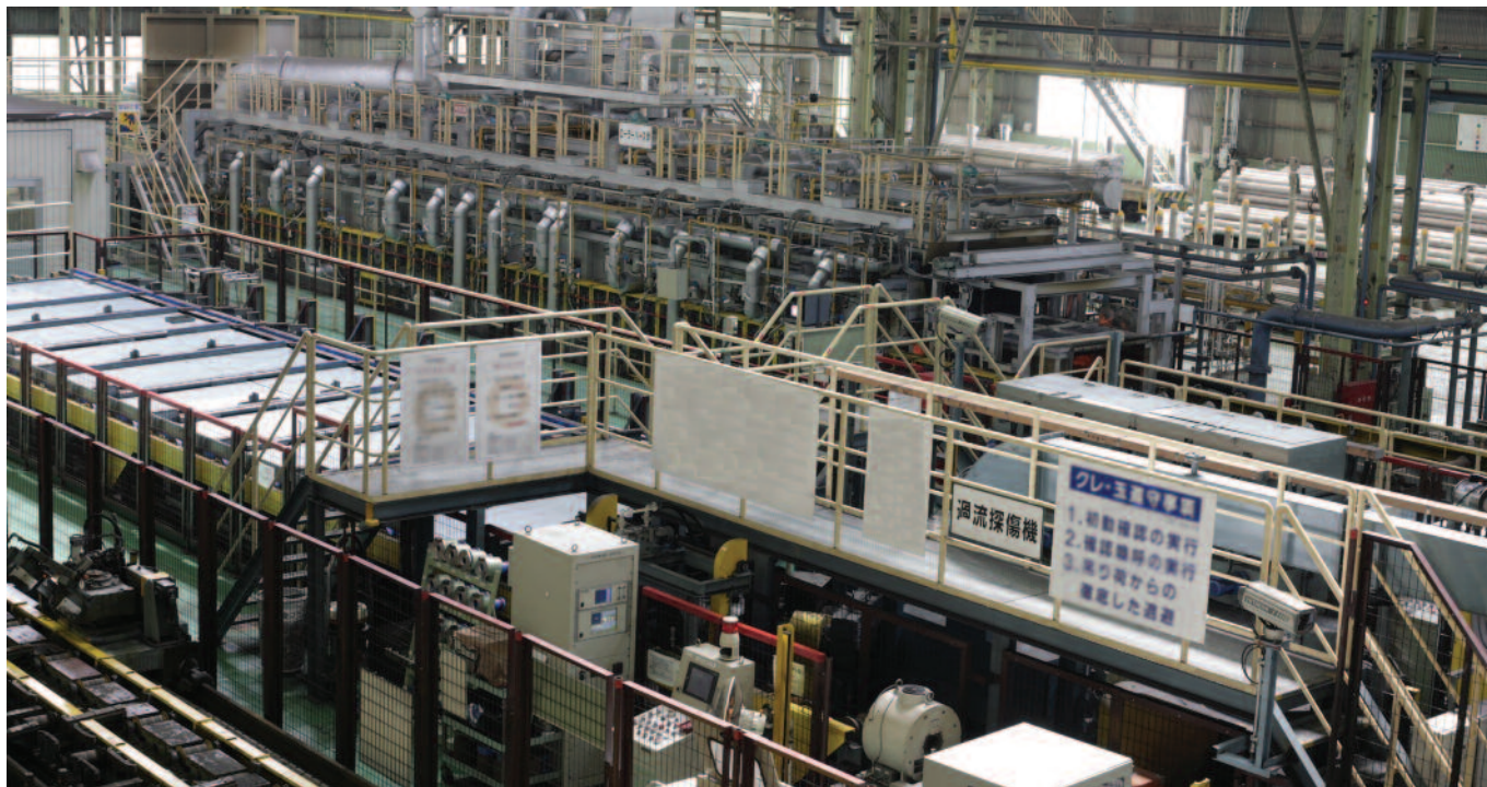
Inside the Amagasaki plant.

development of a copper mine. Sumitomo Metals also tackled the problem of air pollution through an improvement in copper refining technology, and the lush mountains and fields were restored.