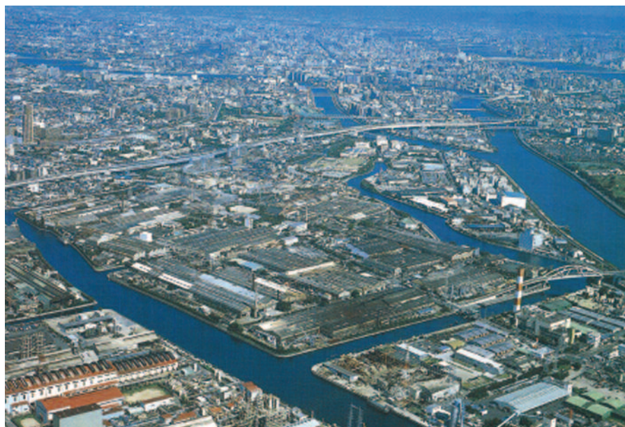
An aerial view of the Amagasaki plant near to Osaka in Japan.

Another memorable moment during the tour came when standing in the control room of an extrusion plant. Here, mother tubes are made for seamless cold working. The hydraulic forces are simply tremendous, and the control room floor literally shakes as the billets of hot metal are forced through a die and a mandrel. Power without precision is next to useless, of course, and so further down the line a straightening machine ensures that the resultant tubes and pipes are dimensionally perfect. Finally, in the spick and span finishing area, Sumitomo Metals staff explain how tubes can be U-bent to exact specifications before being inspected and packaged. The only part of the finishing shop that was off-limits was the area for nuclear power plant tubes. Here, Sumitomo Metals' standards for cleanliness would do a hospital proud. Whilst looking over this particular section, Mr Anada points out that Sumitomo Metals recently won orders for steam generator tubes for a new