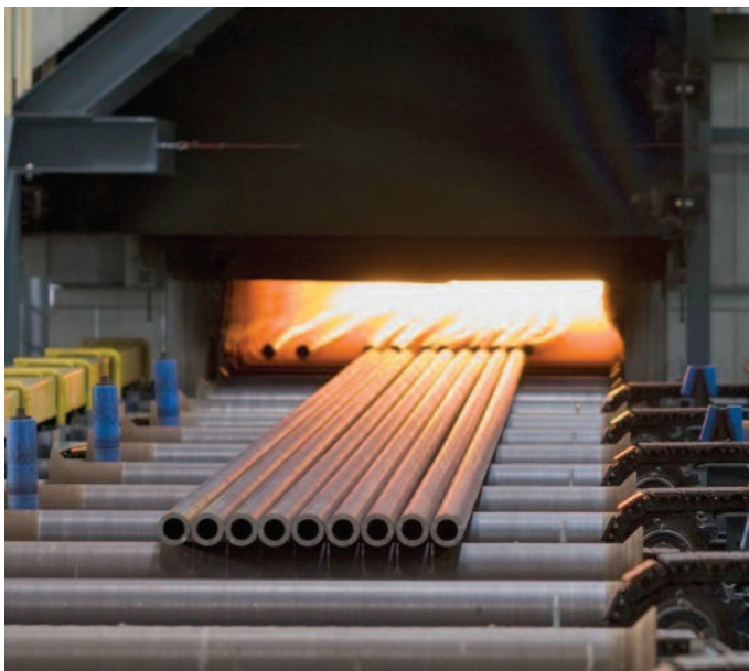
Heat treatment furnace