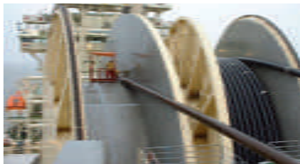
Roll-bonded clad plates offer the characteristics that allow offshore pipelines to be reeled.

Another application of metallurgically bonded clad pipes made of roll-bonded clad plates are so-called catenary risers in the offshore industry. These vertical pipelines connect the subsea gas or oil field with the production facilities above sea level. Due to the high pressure of deep water installations and dynamic loads