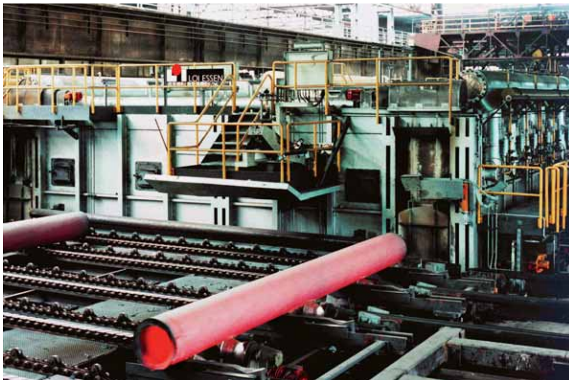
Tubes from Schenk Stahl GmbH must be able to withstand temperatures of up to 1200 degrees Celsius.