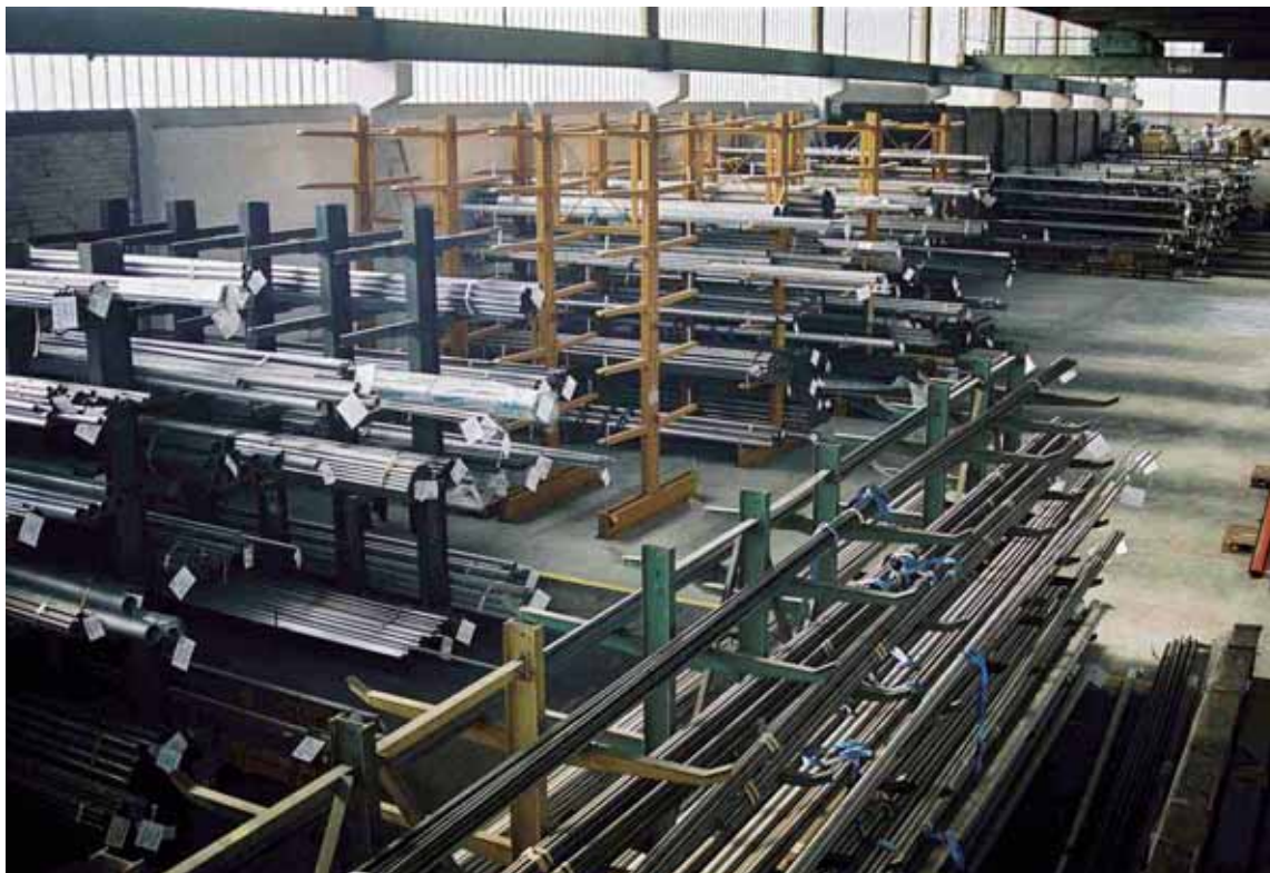
Schenk Stahl GmbH's warehouse of heat-resistant tubes is one of the largest of its types in Europe.