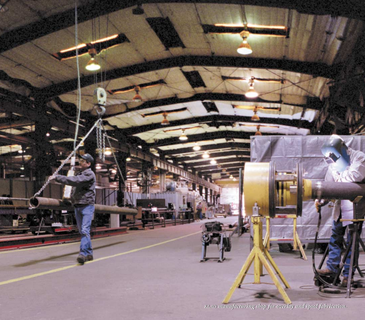
KLAD manufacturing shop for overlay and spool fabrication.