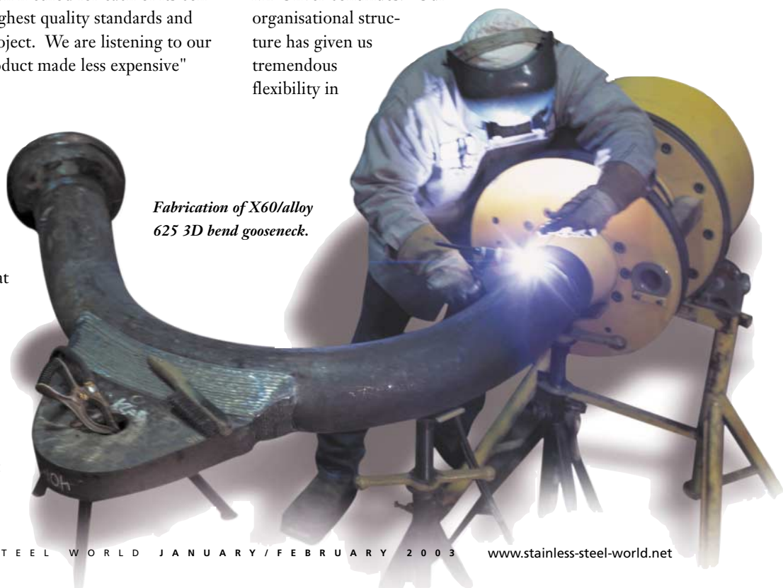
Fabrication of X60/alloy 625 3D bend gooseneck.

Mr Oliver continues: "Our organisational structure has given us tremendous flexibility in