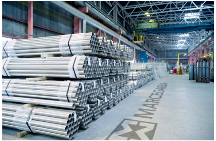
Marcegaglia Specialties has played a key role in the promotion and the drafting of the EN 10357 European standard, which relates to austenitic, austenitic-ferritic and ferritic longitudinally welded stainless steel tubes for the food and chemical industries.

standard. This new specific standard relates to austenitic, austenitic-ferritic and ferritic longitudinally welded stainless steel tubes for the food and chemical industries. Other key quality certifications obtained in the last two years were related to production of highly technical profiles such as welded tubes for naval applications (RINA approval for tubes according to EN 10217), food and dairy applications (TIFQ and EHEDG approval) and drinking water applications (DVGW 541 approval). The Quality System is certified according to ISO 9001/15 and IATF16949. Welding procedures are certified according to ISO3834-2.