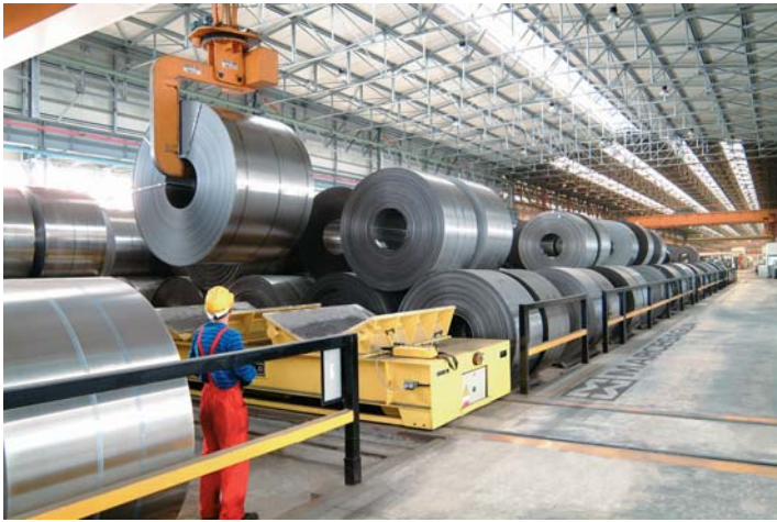
The company's plant in Gazoldo, Mantua, Italy, processes 2D/2B cold rolled coil and strip with 0.8mm to 5.0mm thickness, 1D hot rolled coil and strip with 2.0mm to 6.0mm thickness, 1D hot rolled and 2D/2B cold rolled sheet 1,000/1,250/1,500mm wide.