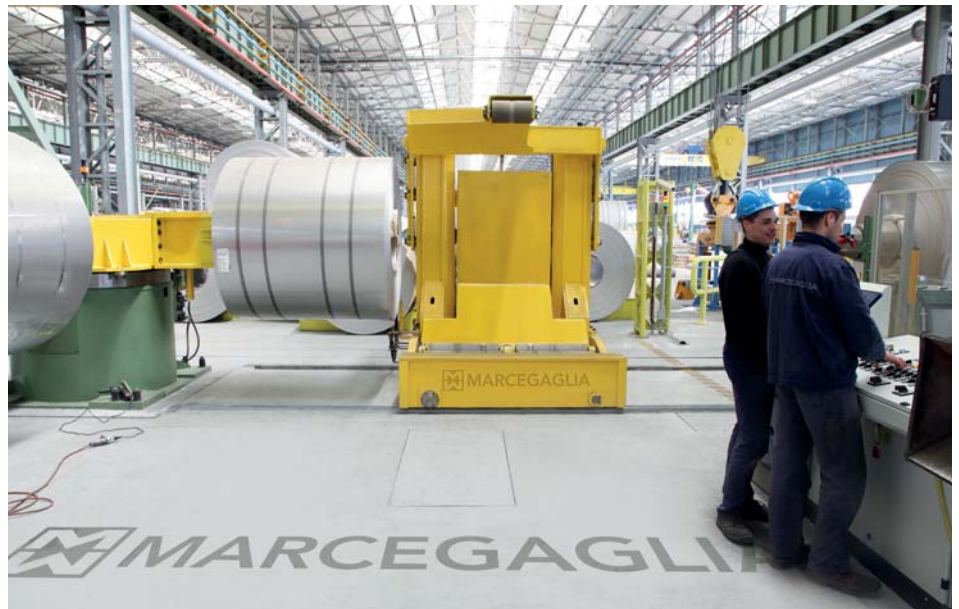
Marcegaglia processes 5.8 million tons of steel annually, resulting in a turnover of over 5.2 billion euros

marks such as DVGW for water and gas pipes in the energy sector, TÜV-PED and TÜV AD2000 W2/W10 for pressure equipment, compliance with EC 1935/2004 by TIFQ and EHEDG certified for food and chemical industry.