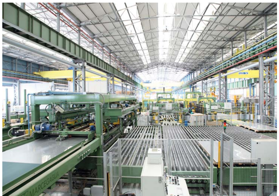
Marcegaglia Specialties is an important player in the production of stainless steel flat products such as austenitic and ferritic coils, strips and sheets.

Thanks to its status as a leading producer of stainless steel welded tubes Marcegaglia Specialties has also played a key role in the promotion and the drafting of the EN 10357 European