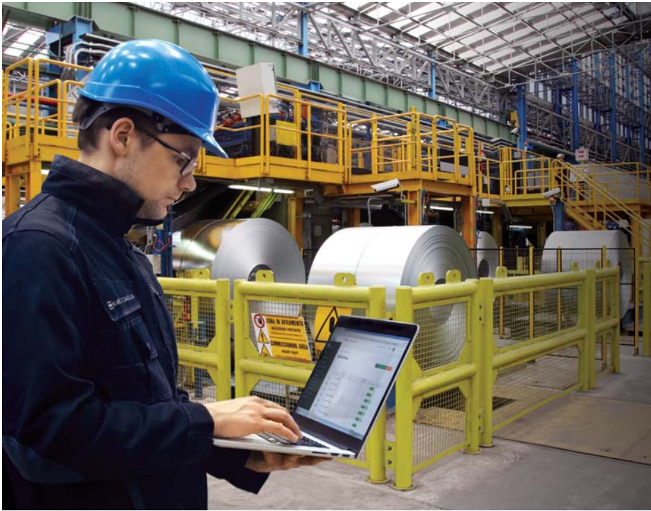
The company guarantee of consistent levels of quality for all products and services across its six manufacturing plants worldwide.

for bus frames and other structural applications in the commercial vehicle industry.