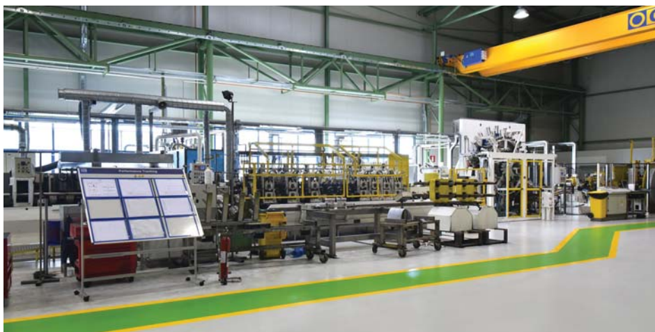
Thanks to the introduction of lean manufacturing AST was rewarded with 2018 Kaizen Blitz Award.