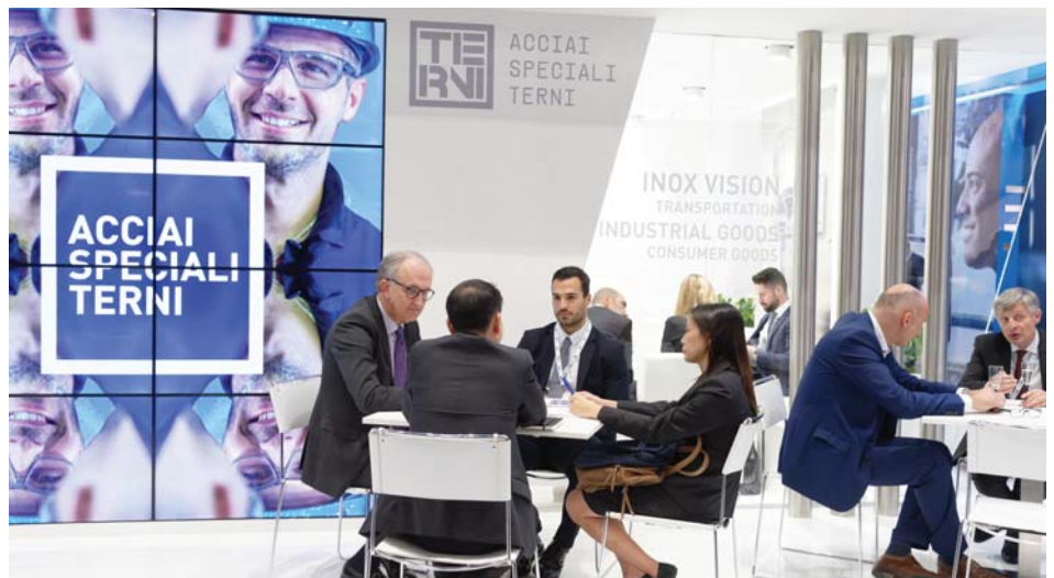
AST successful sales team meets customers at Tube Fair 2018.

Safety, health and environmental issues are deep-rooted within AST's corporate philosophy. The company has certified its environmental management system according to ISO 14001, focusing on environmentally-friendly energy management. The re-naturalization of its slag area into a green area open for the city, and an international tender to find a final solution for recycling the slag resulting from stainless steel manufacture, are examples of this philosophy. Another recent environmental project was the complete redesign of the scrapyard with a focus on environment, sustainability, automation and digitalization. New technology and processes were utilized which, combined with a mobile IT system, has made it possible to follow loading operations in real time and trace the