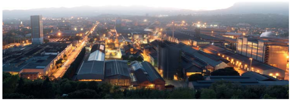
Over 1.500.000 square meters of AST manufacturing facilities covering the entire production cycle, from melting to final product.

Tube production is an additional excellence of Acciai Speciali Terni. Superior craftsmanship in tube production has, within just a few years, positioned AST-Tubificio di Terni as a market leader in the exhaust system industry. The most important European automotive brands have chosen AST stainless steel tubes for high quality, performance and a wide product range along with tailor-made service solutions. The tubes are welded by an electric arc (TIG, GTAW), by high frequency induction welding (HF) or by laser welding.